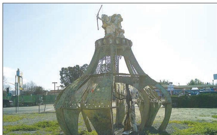
Current art installation at the Hesperian Triangle (E. 14th Ave & Hesperian Blvd).